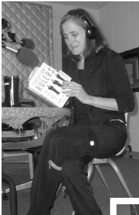
▲ Amy Goodman, host of Democracy Now! , visited the WORT studios on June 18 and read excerpts from her new book Exception to the Rulers . The following day, Goodman gave a lecture benefiting WORT and WYOU at the Barrymore Theater to a crowd of over 700. "Exception to the Rulers" will be available as a thank you gift during the WORT Fall pledge drive.