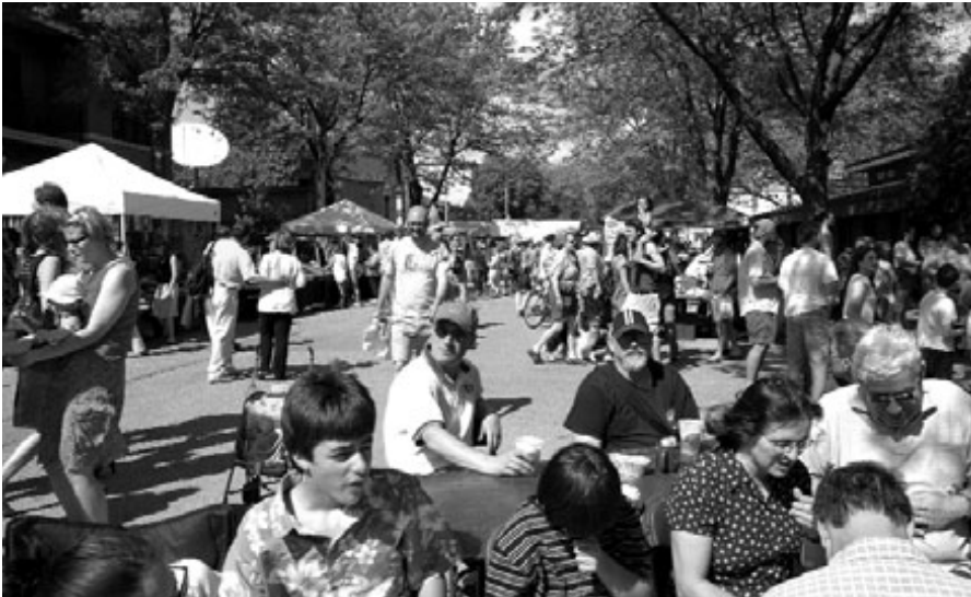
▲ Scene at the WORT Block Party, May 2005.