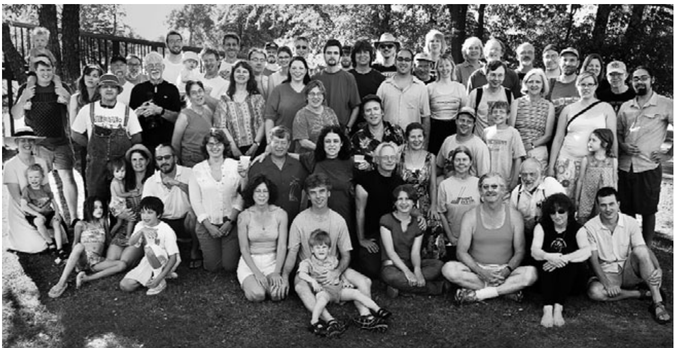
▲ WORT volunteers and staff gather at the Reunion Picnic. A 10-inch color proof is posted in the station lobby and available to order.

The party spirit prevails throughout the fall as we head into the 30 Years In Your Ears pledge drive and WORT’s December 3rd birthday bash. Stay tuned for more festivities.