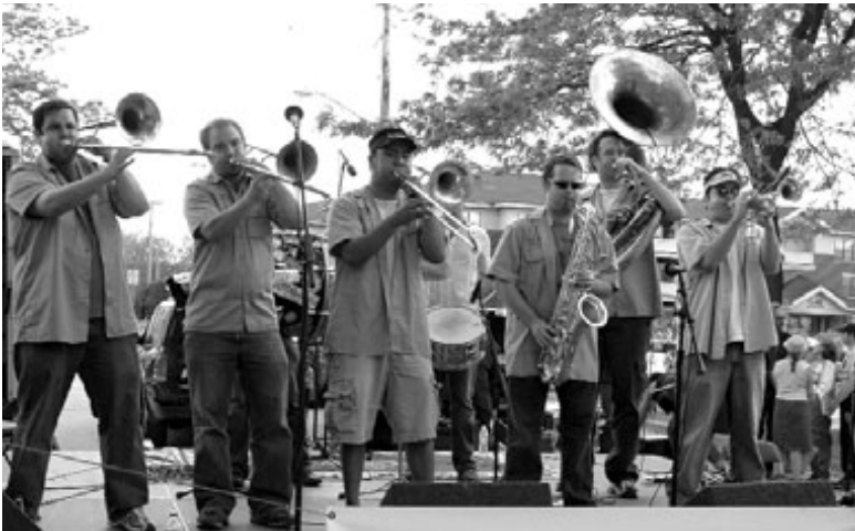
▲ Mama Digdown's Brass Band performs at the WORT Block Party in May.