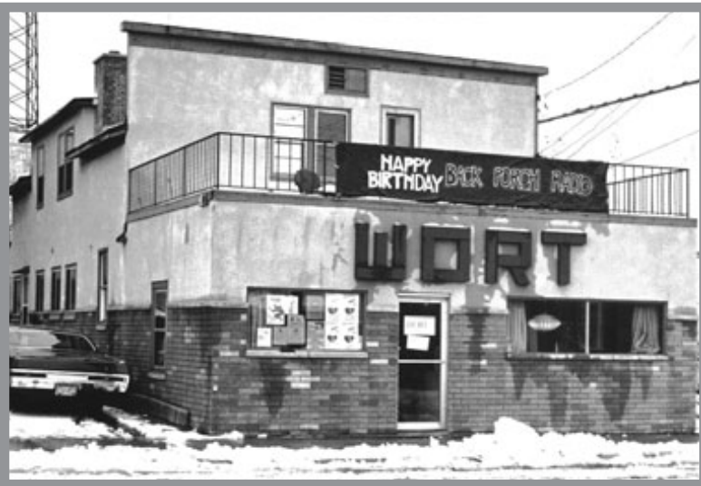
▲ WORT celebrates its first birthday at the original rented studios on Winnebago Street. (The building has since been demolished.)

Some volunteers leave while new volunteers step up and find their own way to do radio. We've always needed your help—the community is our pool of listeners and of volunteers. Tell your friends about WORT. Help WORT continue to nurture the Madison community.