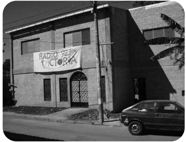
▲ Radio Victoria's new home

We have survived a police raid, two earthquakes, floods, ant invasions, many computer burn-outs,