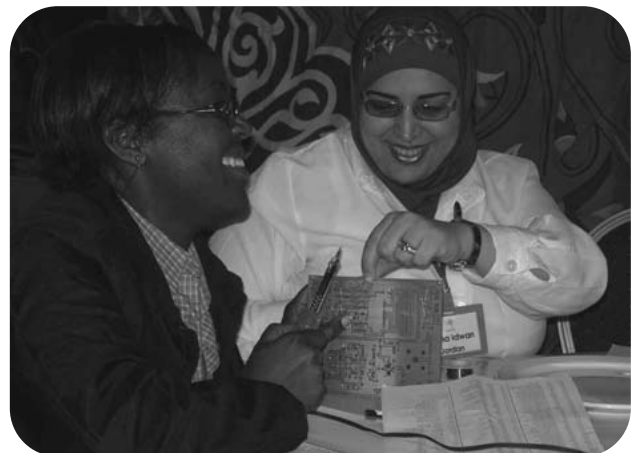
Soldering at the Prometheus transmitter-building workshop

The Arab media activists and journalists at the conference were fully aware of the sad state of Arab media. But we in the United States rarely, if ever, get a glimpse of this debate. It became very clear to me that many people in the Middle East are hungry for an independent media—for stories that