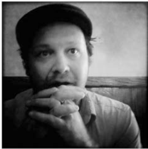
The Delivery Man ponders what songs to play for the next Wake Up futuristic .

Holding down the best time slot in radio isn't easy, folks. Building an avid and devoted fan base is every Delivery Man's dream. This DJ man thinks of it often. How can more earholes be reached, hearts be touched, privacies set ablaze? Through the murk and