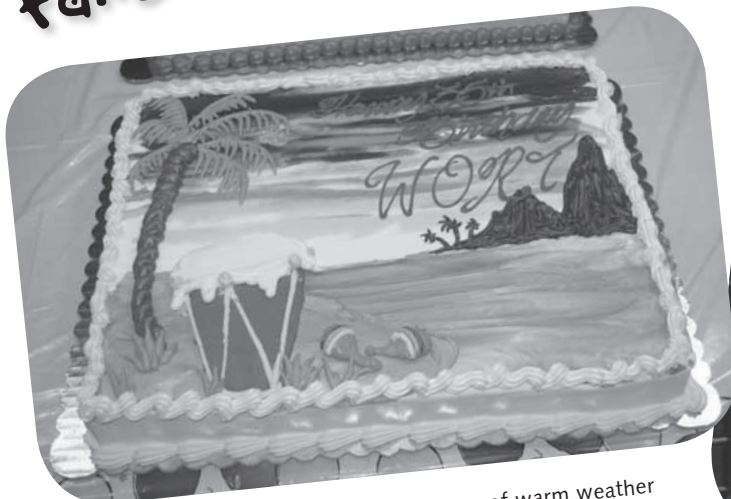
▲ This WORT birthday cake is a harbinger of warm weather to come!