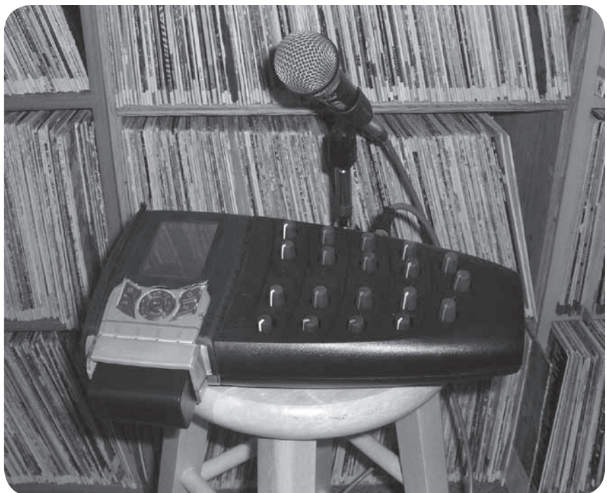
► WORT's new state of the art Comrex remote broadcasting equipment posing for a photo op in front of analog media.

We are still in the process of raising the funds to negate the impact on our budget for this fiscal year. Please consider making a generous tax-deductible donation today and send it to WORT c/o “Comrex Access”. Just six donations of $500 each, or 30 donations of $100 will pay for the equipment. Please be one of those donors and help keep local events coverage alive and vibrant on WORT Community Radio.