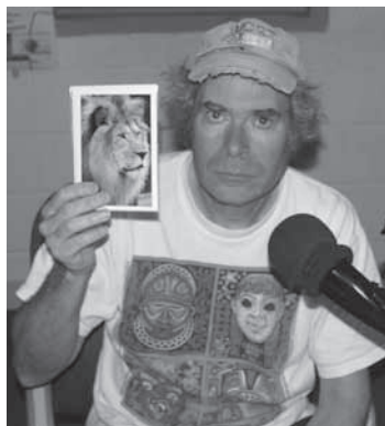
▲ The Radio Naturalist has returned to WORT (sans his pet lion).